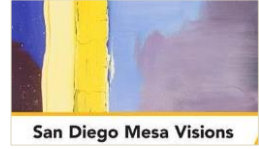
San Diego Mesa Visions