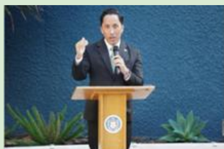
Mayor Todd Gloria speaks during the annual rally of San Diego Youth Services at City Hall on Friday, Nov. 7, 2025, in San Diego.

Congratulations to our Classified Professionals Learning Committee for coordinating an outstanding MiniCON event! This one-day workshop brought the Mesa community together to share ideas and strategies centered on Equity and Excellence, AI and technology, health and fitness, and more.