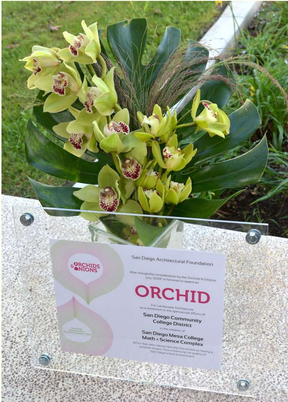
Board of Trustees Mesa College Meeting - Thursday, October 8th